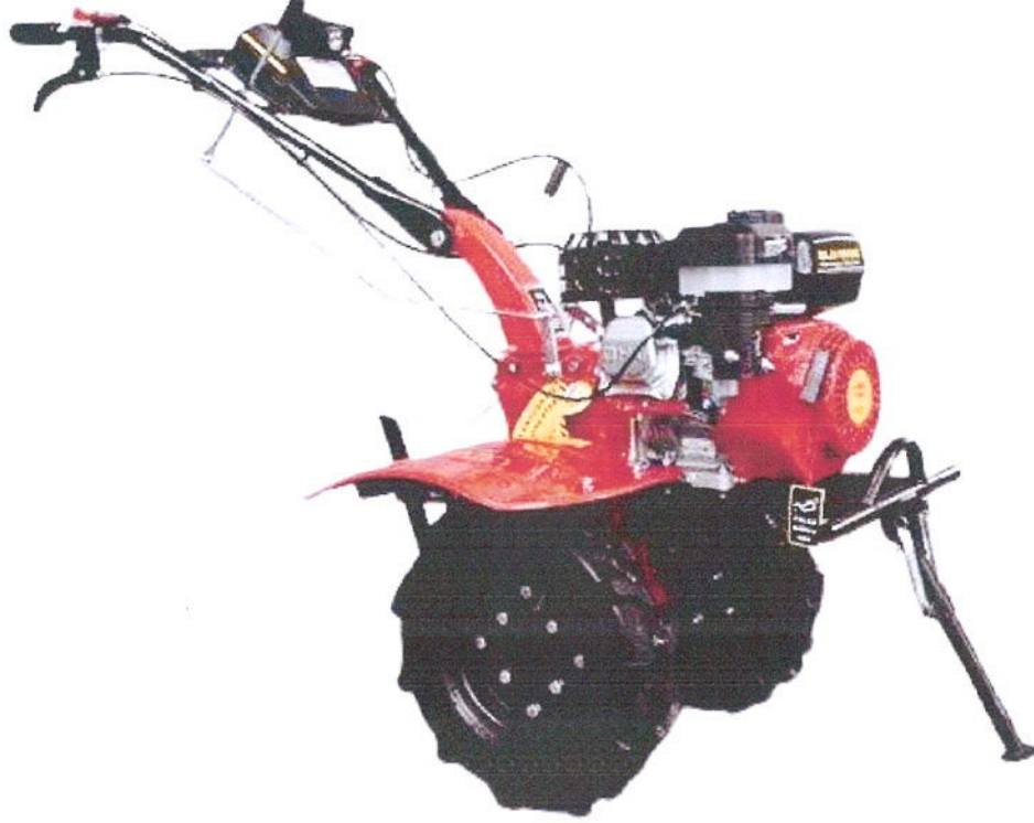
RAJA, 1000G POWER WEEDER

THIS TEST REPORT IS VALID UP TO 30.06.2032